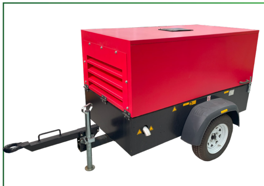
Jinker trailer as standard