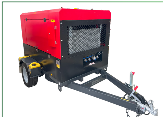
Optional road registered trailer