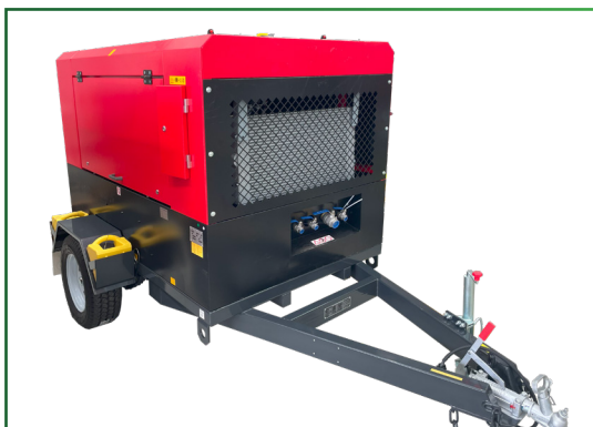
Optional road registered trailer