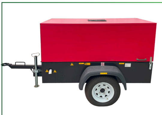
Jinker trailer as standard